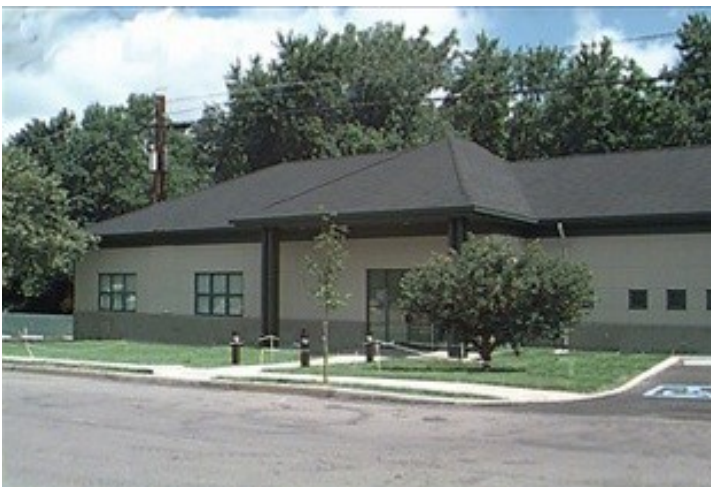
Lackawanna Housing Authority in Dunmore, Pennsylvania

We will be putting out more newsletters throughout the year to tell you of other projects that will be happening within the organization. This way you will know if anything is planned at your local facility.